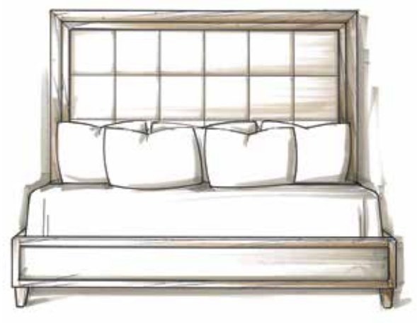
Biscuit Tufted (B)