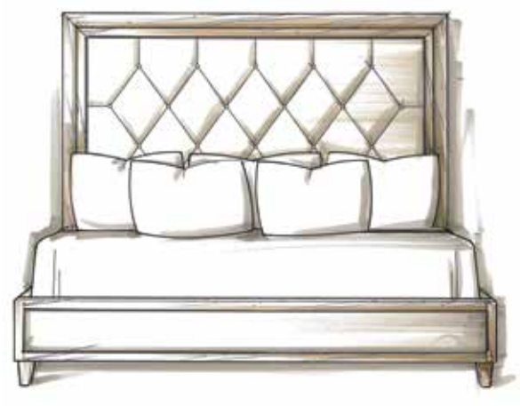
Diamond Tufted (D)